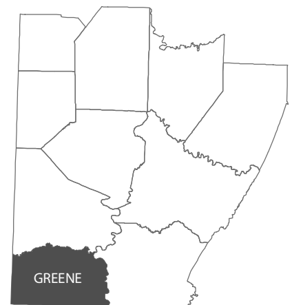
Location of Greene County in SPC 10-County Region